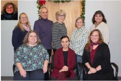
The ASK Staff